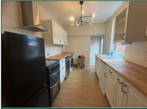
GROUND FLOOR 495 sq.ft. (46.0 sq.m.) approx.